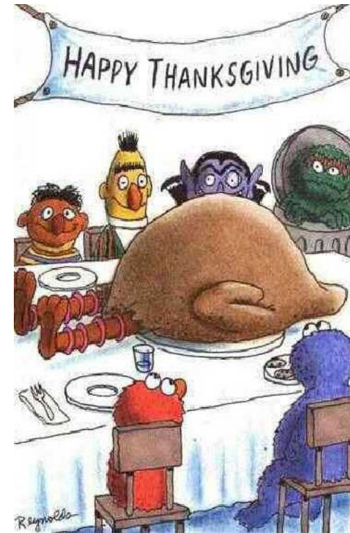
Wait... is that Snuffelupagus stuffing?!