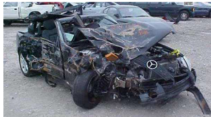
This is what those Mercedes cars would look like if they tried one winter up here. Ha!

NOW, AS MANY OF YOU MAY OR MAY NOT KNOW, I'm not a local. Most people aren't, I'd assume, but I'm not even anywhere near local. See, I come from the West Coast. Orange County, California to be specific. Being that I come from such a different place, it's only natural that I'd have a few things that I've learned in my almost exactly 3 month stay in the middle of nowhere, so here's just a small list of them.